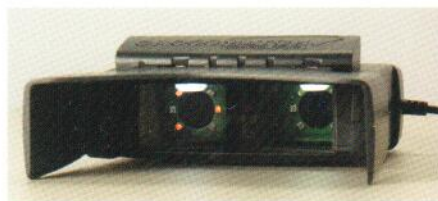
I SCAN 2 captures iris images in less than ten seconds and weighs just over one pound